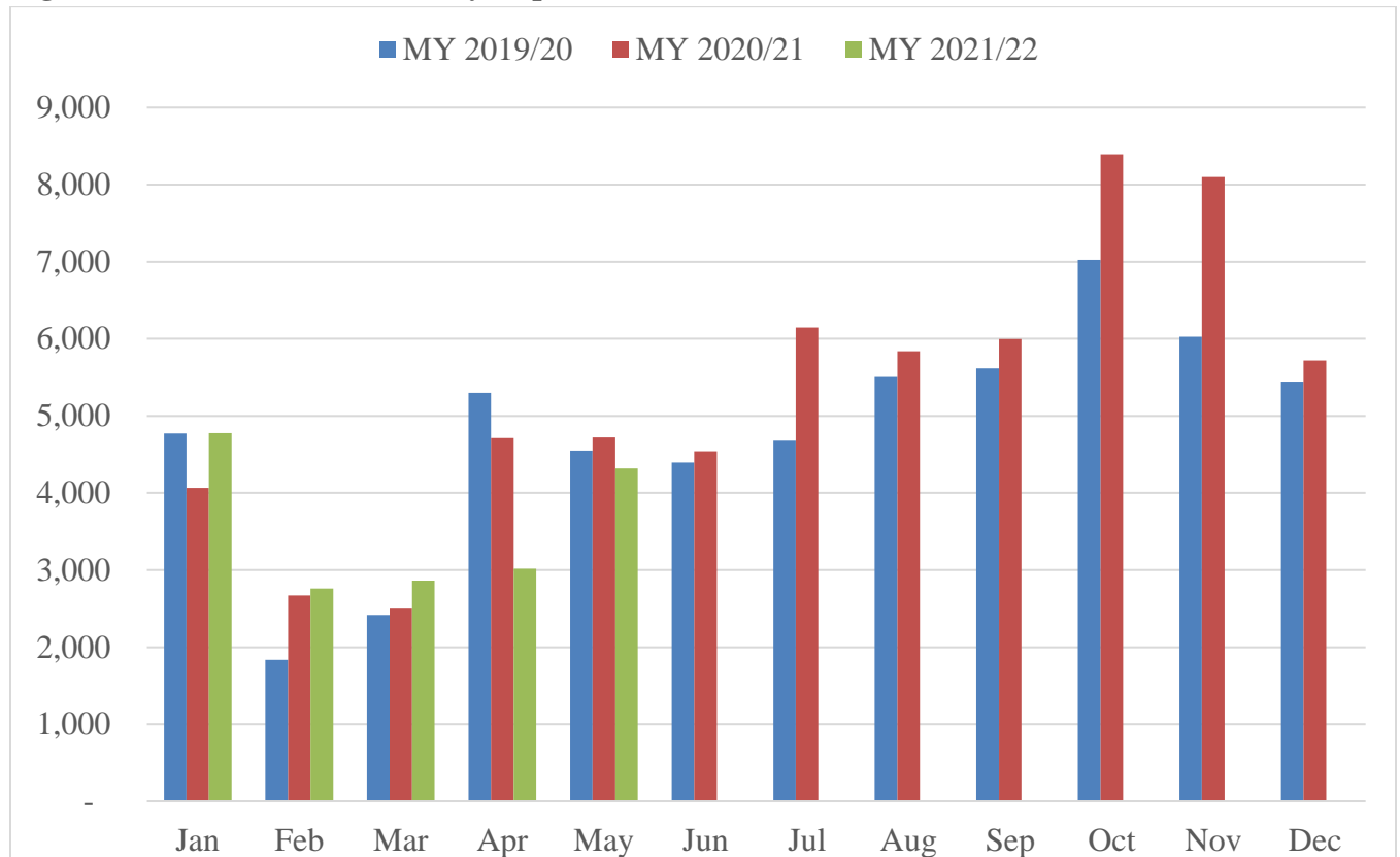
Figure 2: Chilean Raisin Monthly Export Volume (MT)